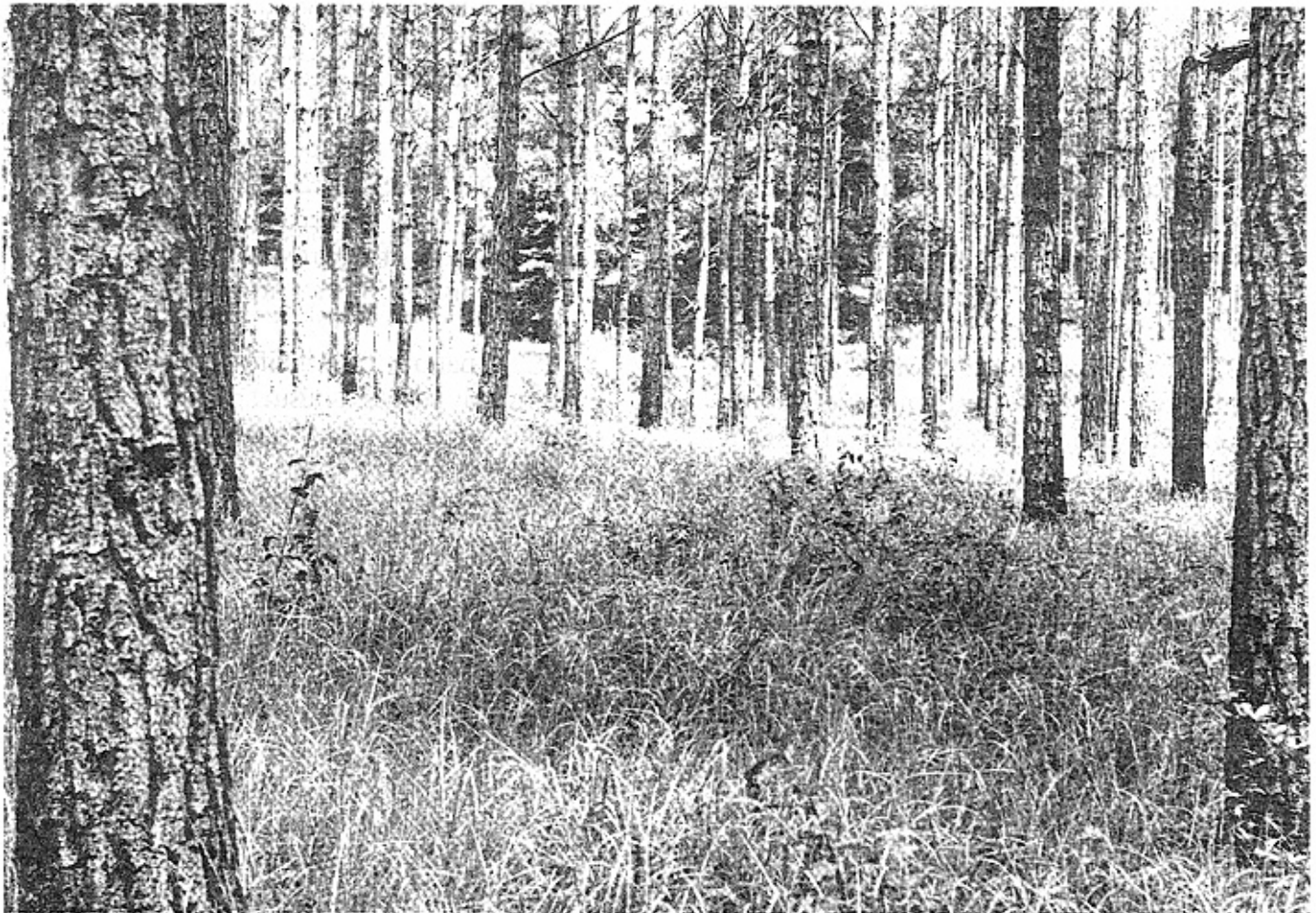
Figure 1. — Bahiagrass has persisted and responded to prescribed fire in this soil bank planting of slash pine in pasture in the mid-1950's.

sands of additional acres of bahiagrass pasture have been seeded naturally or deliberately planted to pine. The information in this bulletin applies primarily to the eastern coastal plain region and to the south, where sandy and gently sloping or level sites are found. This bulletin is intended to help foresters and related professionals to assist landowners who have both cattle and timber management capabilities and objectives, along with the financial and physical resources needed to make such management practical and profitable.