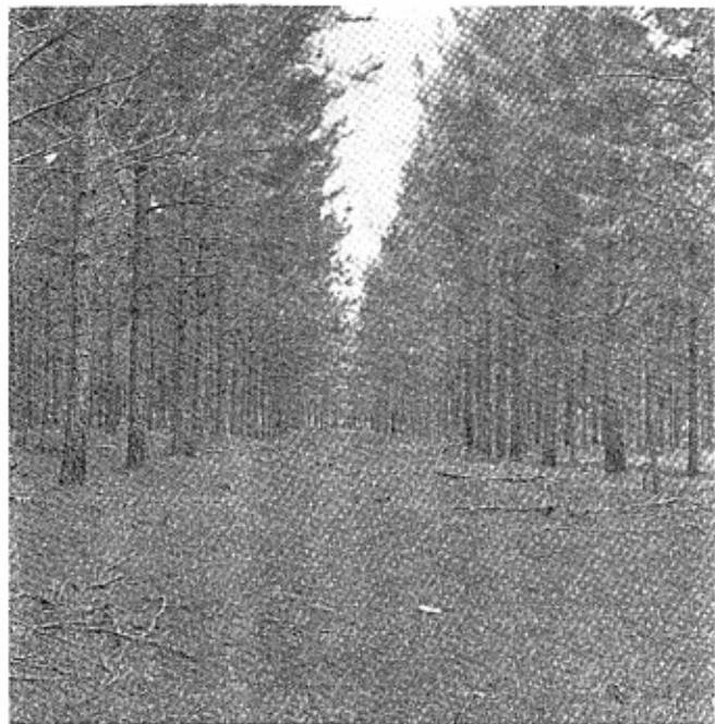
Figure 4. — This intensively managed stand was thinned after only nine growing seasons. Note how livestock have eliminated the buildup of slash from thinning.

By the time the stand is old enough to thin, truck access may become difficult. Removal of every third or fourth row plus other selected trees, may be a good solution (figure 4). If row thinning is done, make every possible effort to remove all other trees that will die before the next thinning, in addition to those in rows. If there is a choice, select wood buyers who use whole tree chippers during harvests. This type of operation removes almost all limbs, leaving very little debris to inhibit grass growth or provide breeding material for pine engraver ( Ips ) beetles. Take care to protect the "leave" trees regardless of the harvest method used.