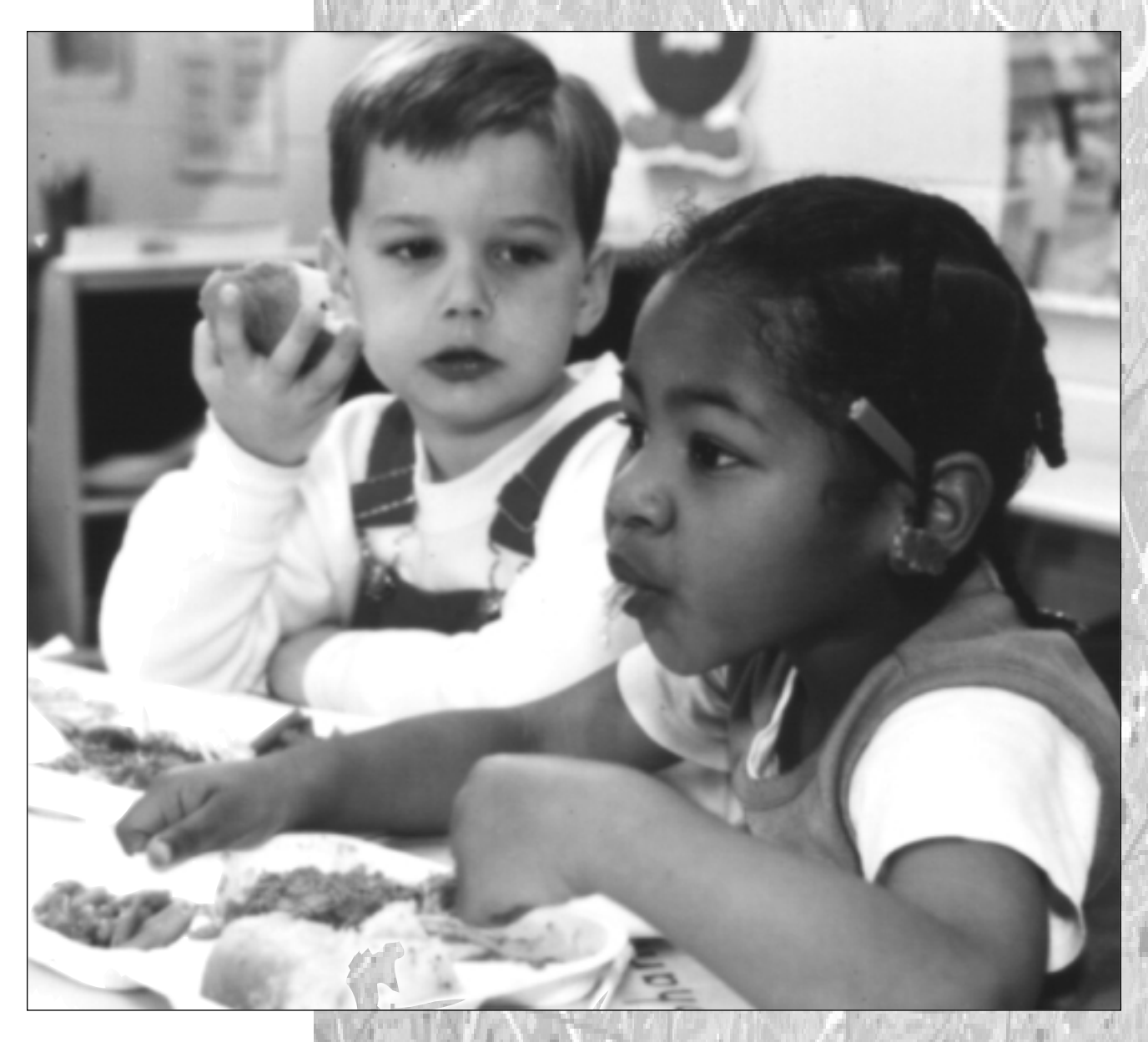
"Look for common ground, the same kind of goals, needs and clients."

—Survey respondent from Trenton, New Jersey