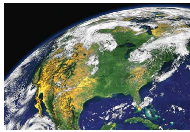
Figure 1-1.

As a party to the United Nations Framework Convention on Climate Change (UNFCCC),¹ the United States shares with many other countries the UNFCCC's ultimate objective, that is, the "...stabilization of greenhouse gas² concentrations in Earth's atmosphere at a level that would prevent dangerous anthropogenic interference with the climate system . . . within a time-frame sufficient to allow ecosystems to adapt naturally to climate change, to ensure that food production is not threatened, and to enable economic development to proceed in a sustainable manner." Meeting this objective will require a sustained, long-term commitment by all nations over many generations.