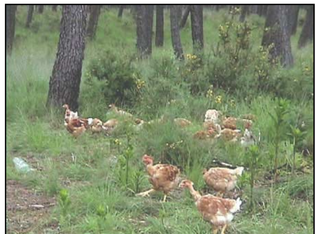
The Landes birds roam in a pine forest.

You can read about the Landes filiera on their website < http://www.fermiers-landais.fr >. (There is an English-language option.)