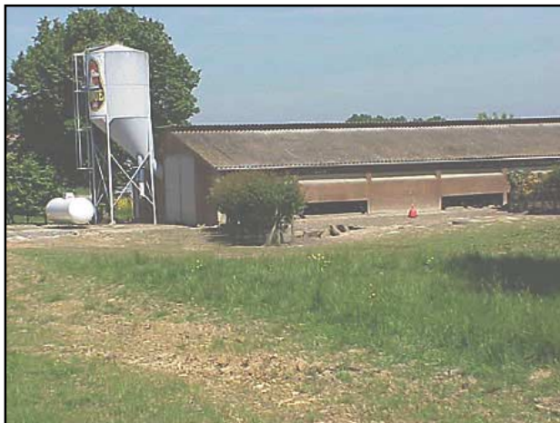
Stationary houses and yards are common in Label Rouge production. This is a Loue farm.

Although Label Rouge production began in the Landes region, it was the Loue filiere that was instrumental in making it a viable industry. Label Rouge did not grow as an industry until the product became widely available at supermarkets.