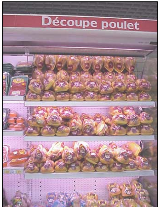
Label Rouge chicken is sold both whole and cut-up in the supermarket.

Most Label Rouge products are sold whole but the amount of cut-up is increasing. About 135 million birds are produced each year, and 15 million are cut-up. Label Rouge also offers an organic product.