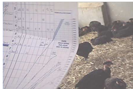
On-farm record-keeping is important not only for charting performance but also for traceability.

Coordination permits quality control throughout the supply chain. If there are broken wings in the picker, where did they come from—the picker or the farm? It helps cooperating growers produce a consistent product.