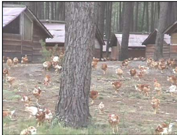
The Landes filiere uses portable housing.

The size of the buildings ranges from 16' x 16' (270 sq. ft.) to 20' x 33' (645 sq. ft.). Older houses were built of wood; new ones are metal. In a dense forest, the smaller houses are used to fit between the trees. Litter is spread in the houses, which are floorless. Brooding is done in the houses with portable gas brooders. Part of the feed is kept outside to help train birds to go out.