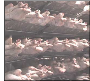
Air-chilling is used instead of immersion-chilling in France.

are many quality-control points during Label Rouge processing to ensure a high-quality carcass. Processing plants in France cool carcasses by air-chilling instead of immersion-chilling. (In immersion-chilling, the carcasses soak up water.)