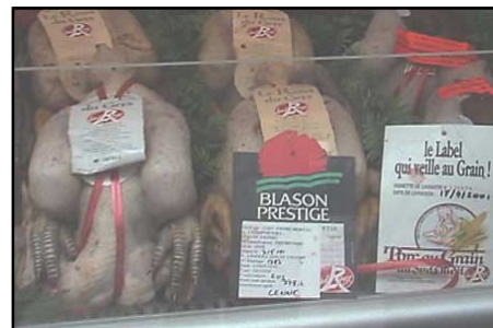
Butchershops sell specialized products, including this Label Rouge poultry with the feet still on.

Processing plants may also handle a variety of species. For example, Fermier Landes processes chickens, guinea fowl, cockerels, and rabbits, as well as capons and turkeys for Christmas. Although it is a large plant, they can put together small custom orders for butchers and other clients.