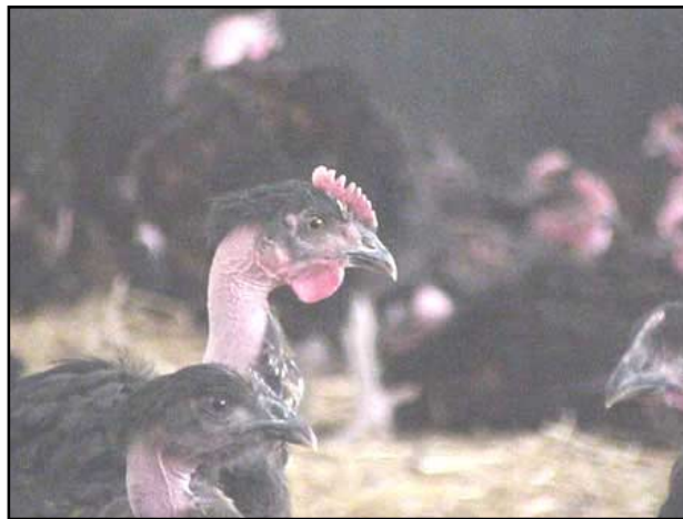
A black SASSO broiler with the "naked neck" characteristic.

At the time of this writing, SASSO and Hubbard-ISA genetics of this type are not available in the U.S. However, a U.S. company called Rainbow Breeding Company (5) is developing similar genetics and offers Free Range (FR) Broiler parents. FR Broiler chicks (day-olds) are also available. Male chicks are regularly available; female chicks are available only sometimes since they are used more in breeding; females grow at 85% the rate of the males.