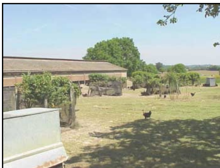
Access to range is an essential part of Label Rouge production.

The Label Rouge program focuses on superior quality and gourmet taste.