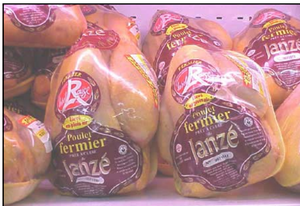
A Label Rouge product in the supermarket.

Interest in labeling is growing in the U.S., where Certified Organic is currently one of the best-known labels. “Quality labels” like Label Rouge provide information to consumers on product attributes such as taste, health benefits, and nutrition, as well as on social issues such as support of local farms. They can also provide information on ecologically sound production practices and other factors related to sustainability. Please call ATTRA for further information on “eco-labeling” and organic certification.