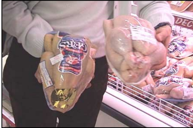
The Label Rouge carcass (left) is more elongated than the compact conventional carcass (right).

In Europe the slow-growing genetics are mainly supplied by the poultry breeding companies SASSO (3) and Hubbard-ISA (4). They do not sell the actual broiler chicks, but rather the parents; however, many pastured-poultry producers have hatching capability. SASSO's typical Label Rouge cross is T44N male x SA51 female (using a different male—the T44NI—results in white underfeathers in the offspring). A typical Hubbard-ISA cross is S77N male x JA57 female. Broilers from both of these crosses will have red feathers, yellow shanks, thin skin, and a naked neck. Other parents are available for broilers with white feathers and skin, black feathers, barred, non-naked neck, etc. or for faster growth.