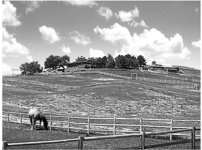
Ada Soil Conservation District

Pastures need less fertilizer than row crops because grazing animals return manure nutrients to the soil. Rotational grazing will distribute manure more evenly. Take a soil test to find out the nutrient levels and pH in your soil. For more information, see the OSU Extension Service publication Pastures: Western Oregon and Western Washington (FG63).