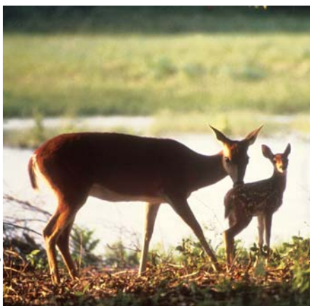
White tailed deer

first weekends of the month. Most wildlife activity has slowed due to warmer weather. Deer are giving birth as are many other wildlife species. Songbirds are tending to young. Wheat is harvested and soybeans are planted. Field