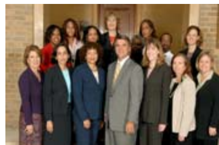
The Food and Nutrition Service SNAP Team with Acting Secretary Chuck Conner.