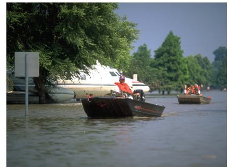
During the 1993 Midwest floods, boaters pass an airport in Chesterfield, Mo., Friday, July 9, 1993.

Reduction of flood losses must be based on the best possible understanding of how and where floods happen and how they cause damage.