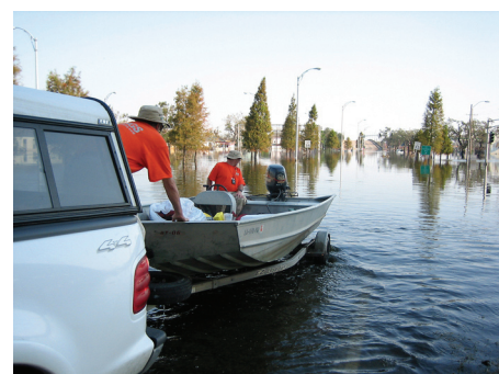
USGS biologists prepare to launch a wetlands research boat for search and rescue in New Orleans during flooding from Hurricane Katrina, Sunday, September 4, 2005.