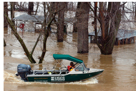
During flooding, USGS hydrographers prepare to make a streamflow measurement at the White River at Petersburg, In., Tuesday, January 11, 2005.

The USGS helps the public, policy-makers, and the emergency management community make informed decisions on how to prepare for and react to flood hazards and reduce losses from future floods.