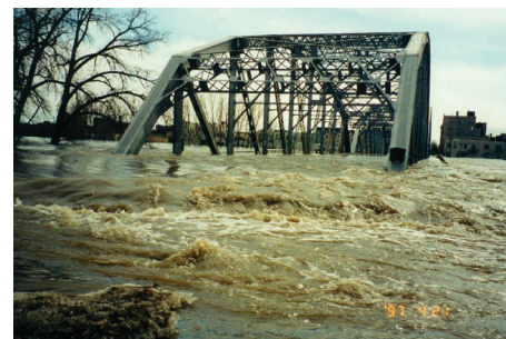
At the Sorlie Bridge between Grand Forks, N. Dak., and East Grand Forks, Minn., floodwaters from the Red River of the North crest at 54.35 feet, Tuesday, April 22, 1997. This depth was more than 24 feet above flood stage and more than 4 feet above the previous record.