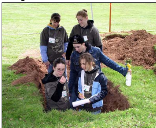
Students participate in Soil competition at 2005 Envirothon in Bridgewater

► 2005 Conservation Education Awards Ceremony -- An awards ceremony in May 2005 at the New Jersey State Museum in Trenton honored the 24 winners of the 2005 poster & bumper sticker contest, whose theme was “Celebrate Conservation”. In addition, the three National Poster Contest winners from New Jersey were presented with Legislative and Congressional Resolutions and this year’s Envirothon winners were recognized.