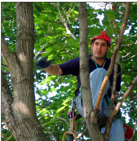
Twelve USDA-FS Smokejumpers conducted survey efforts for the ALB.

► Asian Longhorned Beetle -- In August 2004, a significant Asian longhorned beetle infestation was found in Carteret and Woodbridge, Middlesex County, and Rahway and Linden, Union County. Tree climbers and other specialists from the Department and USDA surveyed more than 56,000 trees. In all, 10,658 host trees were removed in the takedown zones; 518 of these were confirmed as infested, while 21,000 host trees were treated with the preventive insecticide, imidacloprid. The New Jersey Forest Service managed the planting of 2,112 replacement trees in 2005. In July 2005, five new infested trees were found in the southeast section of Linden in Union County and the quarantine area was increased to 16.5 square miles. No new municipalities were added to the quarantine zone. Survey work is ongoing to determine the number