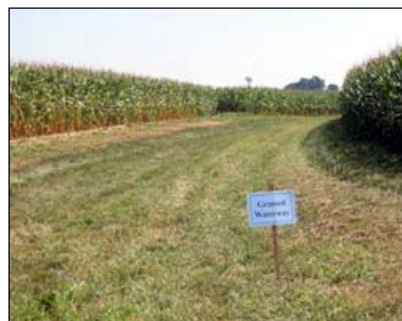
This grass waterway at the Emel Farm in Mannington Township was the 1 st project under the NJ CREP program

▶ CREP Event -- A 3,400-foot-long grass waterway to reduce soil erosion was installed on a Salem County dairy and grain farm – the first conservation practice installed in the state through New Jersey Conservation Reserve Enhancement Program (CREP). CREP is a state-federal partnership effort to work with farmers to convert pastureland or cropland along streams from production to natural grasses, trees and other vegetation to provide buffers. A total of $100 million is available for this program -- $77 million in federal funds and $23 million in state funds.