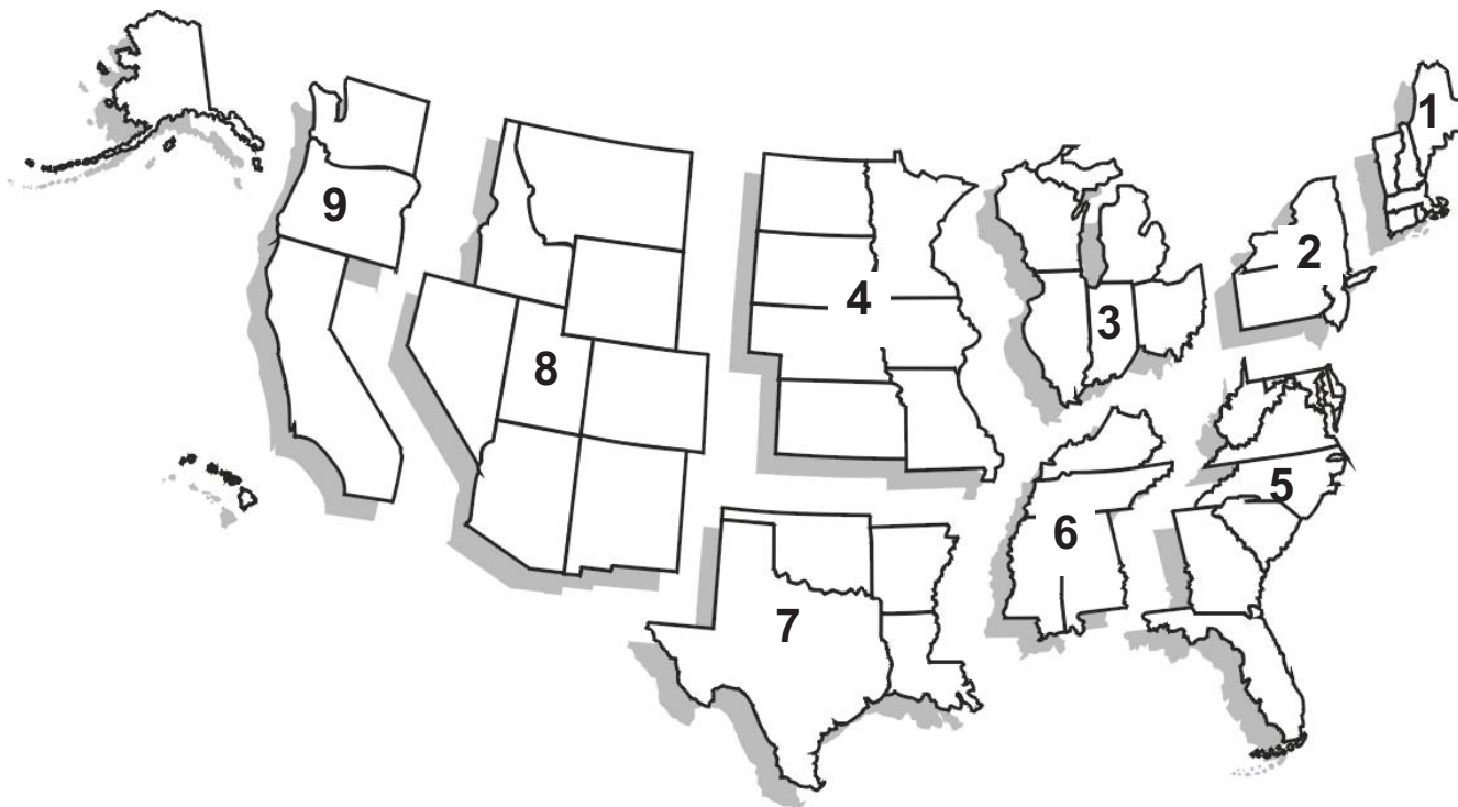
Figure TN1. U.S. Census Regions and Divisions