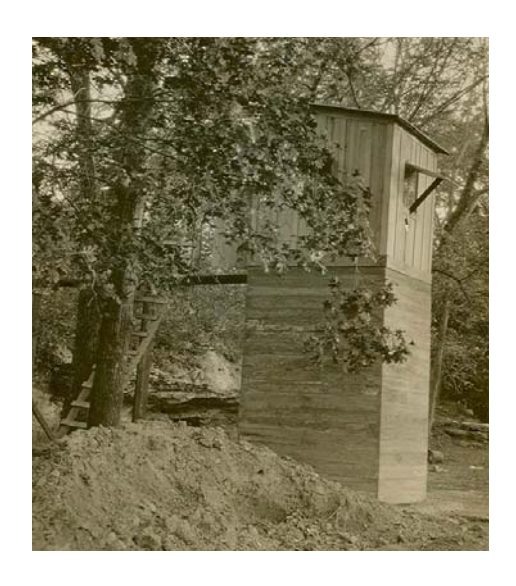
Iola streamgage in 1917