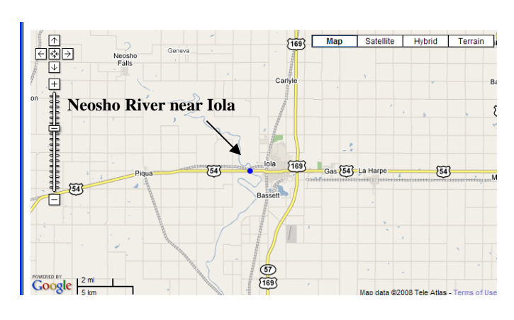
Location of Neosho River Iola streamgage