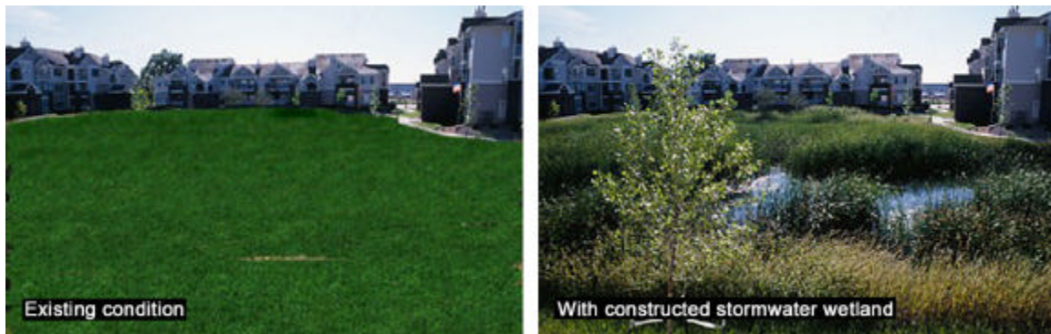
Figure 5. Simulation prepared to assist contractor in constructing a stormwater wetland.