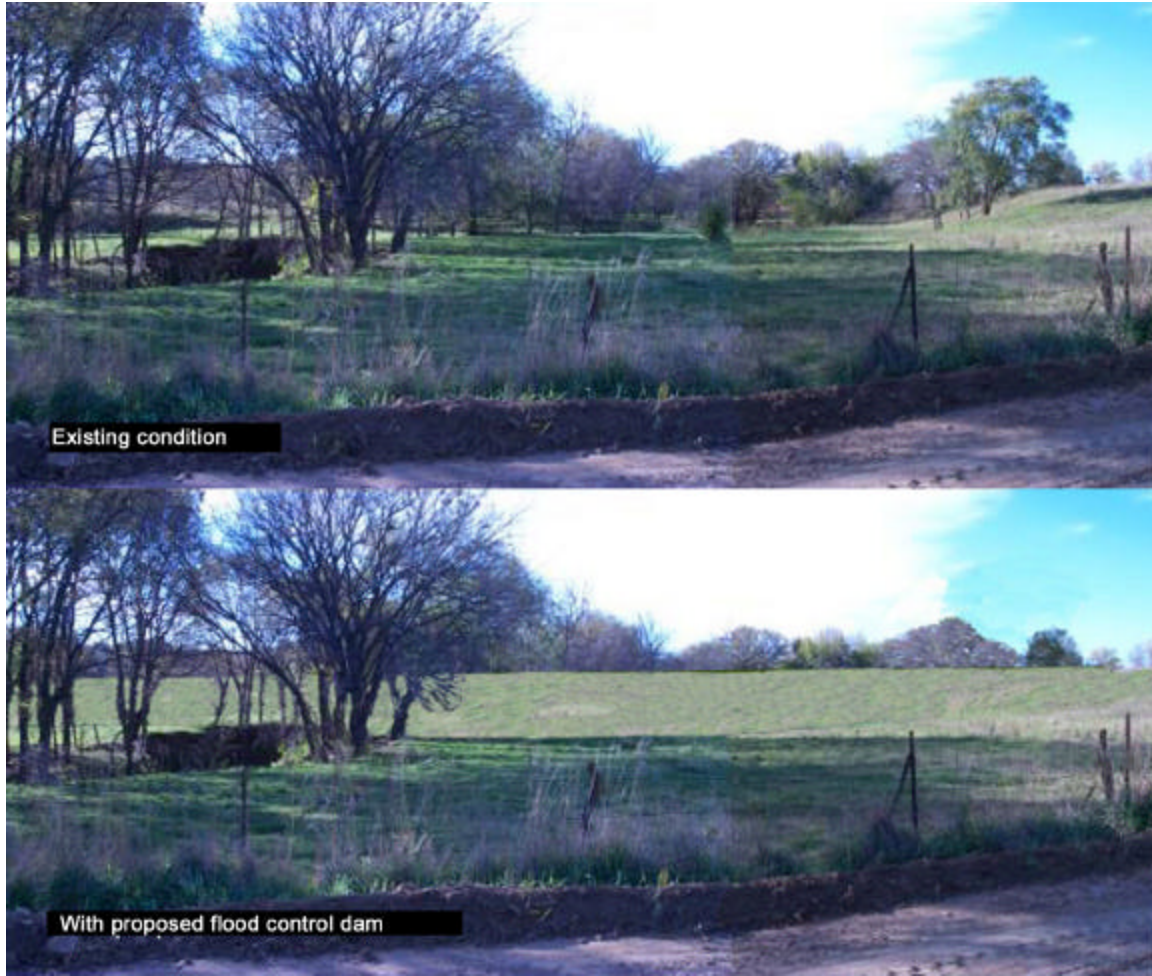
Figure 4. Simulation created for a visual impact assessment for a public hearing.