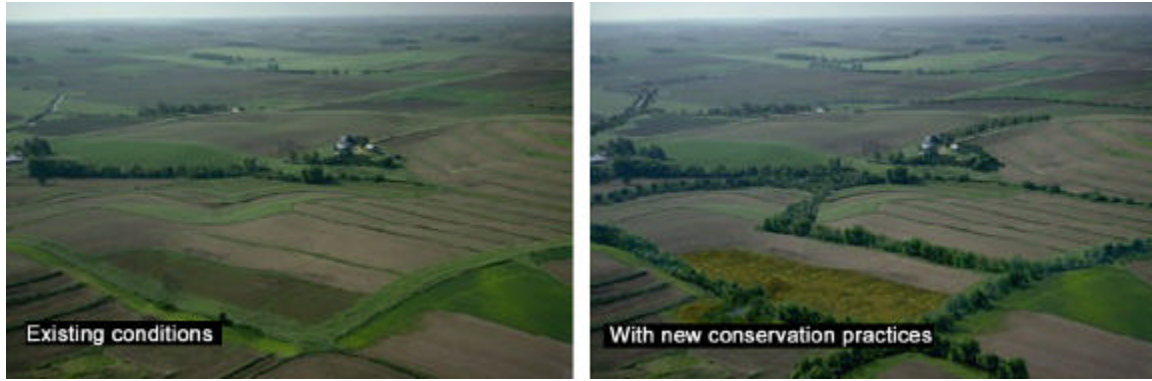
Figure 1. Aerial simulation to illustrate a proposed integrated agroforestry system.