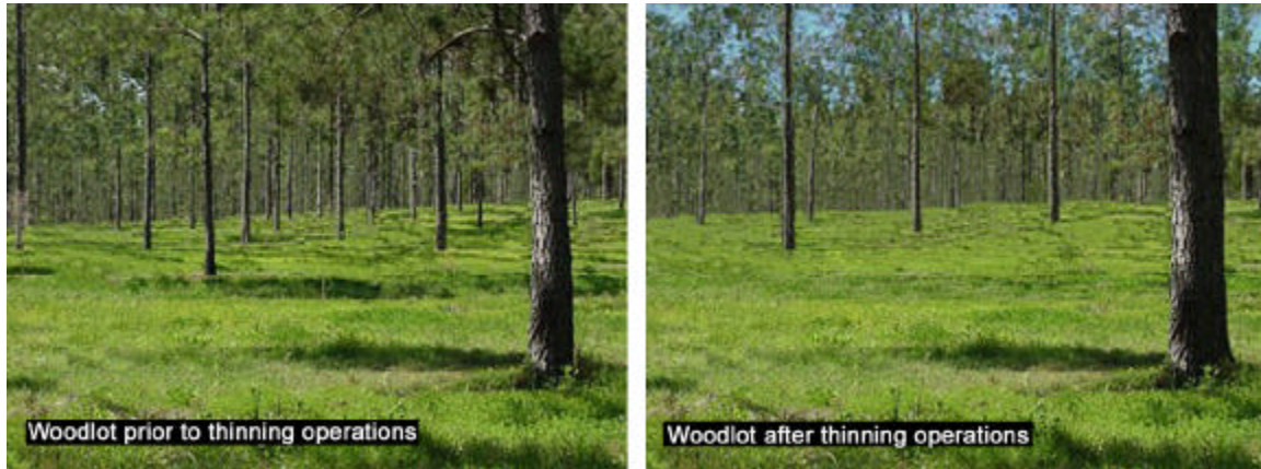
Figure 2. A simulation developed to convey management techniques and impacts for woodlot thinning.