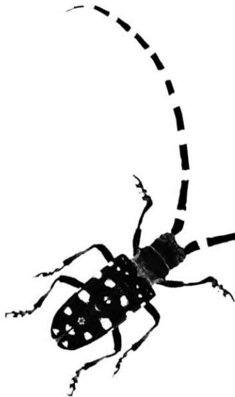
Asian Longhorned Beetle actual size

Intensified surveys are being conducted within and around the circled area