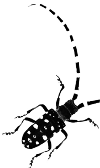
Asian Longhorned Beetle actual size

We need your help in stopping this destructive insect