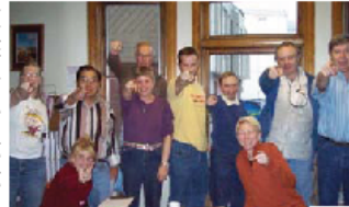
Anti-Hunger Action Committee members encourage people to get involved at a recent meeting at Crossroads.

We work daily with food pantry clients and other low income people, as well as members of many different faith communities, to address the root causes of hunger and poverty. This commitment has led to new funding for low income housing, improvements in health care for the poor, creative options for mobile home park residents faced with eviction, and much more. Please see our web site for details on our plan to cut hunger and extreme poverty in half in Utah.