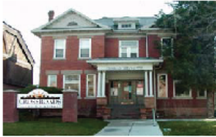
347 South 400 East