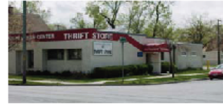
1385 W. Indiana Avenue