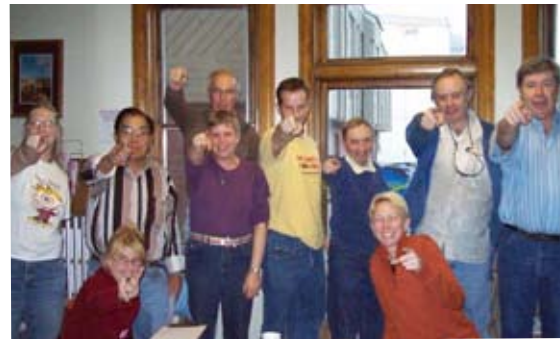
Anti-Hunger Action Committee members encourage people to get involved at a recent meeting at Crossroads.

We work daily with food pantry clients and other low income people, as well as members of many different faith communities, to address the root causes of hunger and poverty. This commitment has led to new funding for low income housing, improvements in health care for the poor, creative options for mobile home park residents faced with eviction, and much more. Please see our web site for details on our plan to cut hunger and extreme poverty in half in Utah.