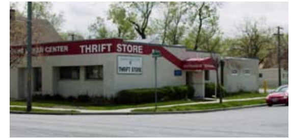
1385 W. Indiana Avenue