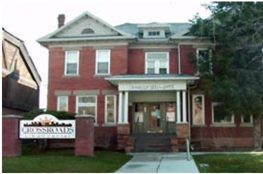
347 South 400 East