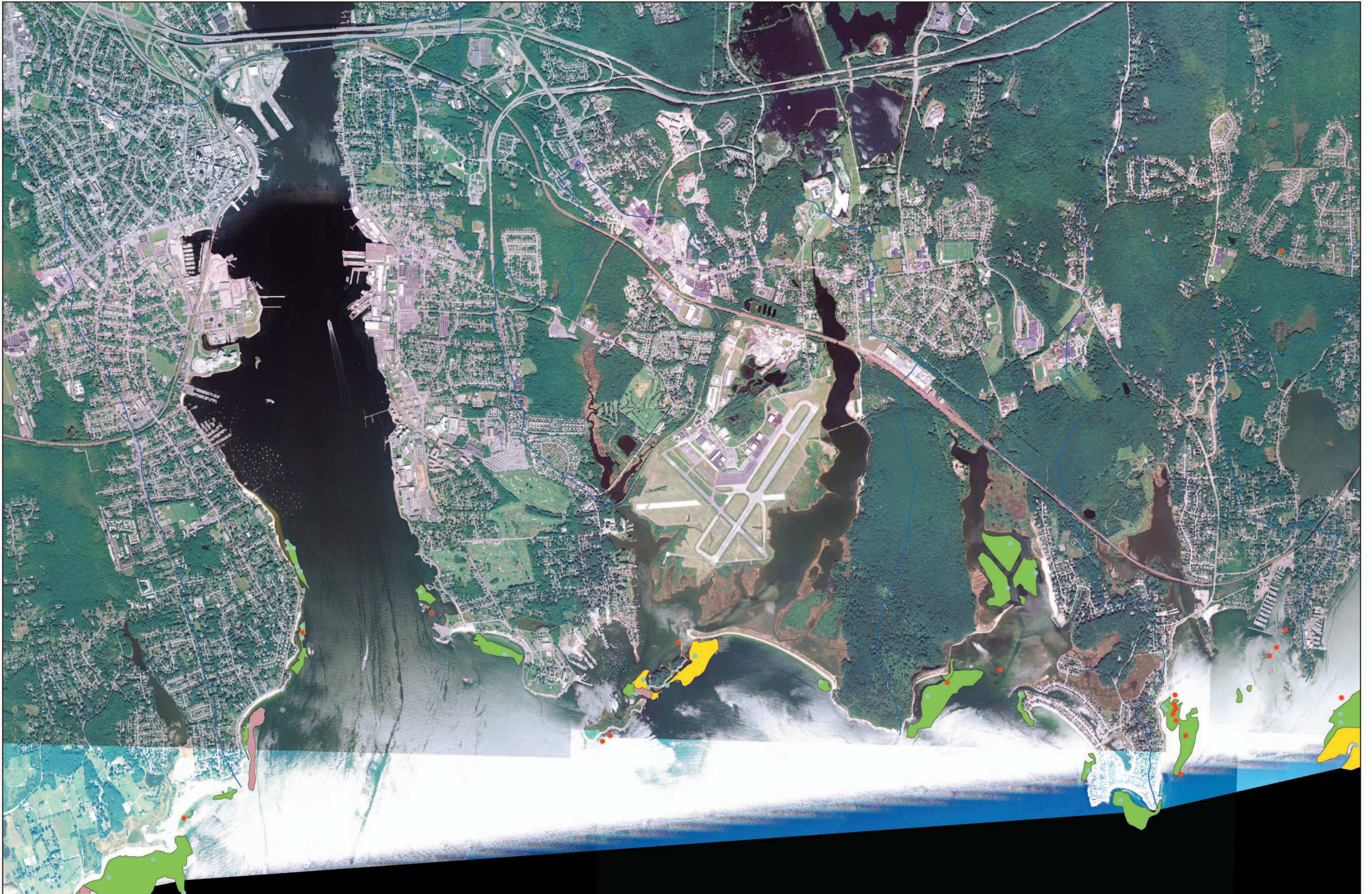
Study Area Locus Map