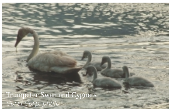
Trumpeter Swan and Cygnets

Many ducks and other waterbirds find food in the mud at the bottom of lakes. Most of these birds also swallow small stones and grit that aid in grinding up their food. Some of the grit may contain lead from anglers' equipment.