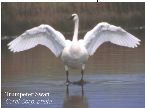
Trumpeter Swan

Waterfowl can die from lead poisoning after swallowing lead fishing tackle.