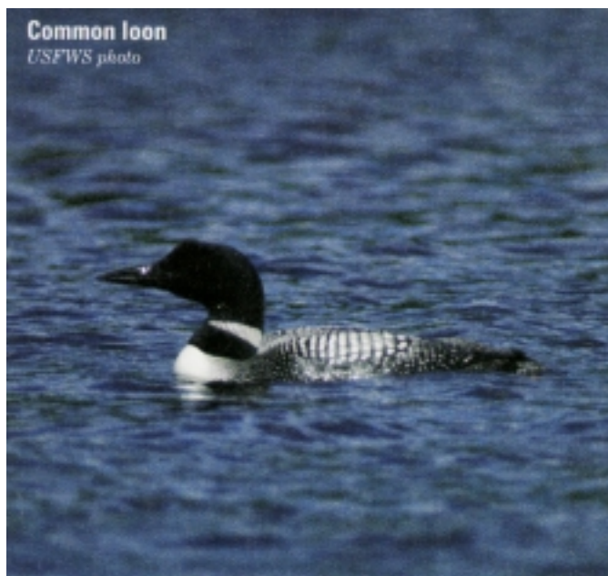
Common loon

Biologists have studied the effects of lead sinkers and jigs on waterbirds, such as loons and swans, since the 1970s. Their ongoing research has documented that, in the Great Lakes region, the northeast United States, and eastern Canada where loons breed, lead sinkers or jigs can account for 10 to 50 percent of dead adult loons found by researchers. Research in New England suggests that this source or reported mortality for retrieved loons is of greater importance than any other observed mortality factor including tumors, trauma, fractures, gun-shot wounds, and infections.