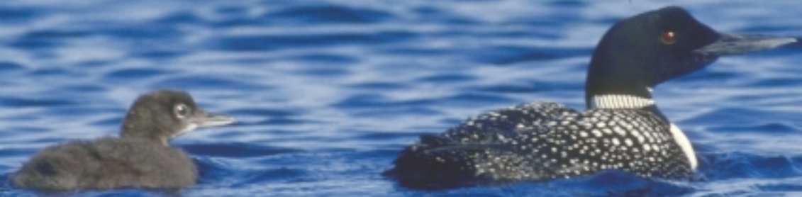
Common Loon and Chick