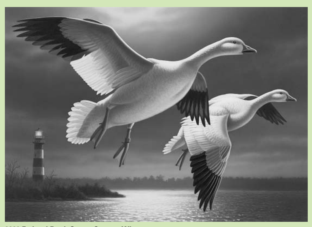
2002 Federal Duck Stamp Contest Winner

Please read all of the enclosed information very carefully and follow the instructions. If all instructions are not followed, your entry may be disqualified from the contest.