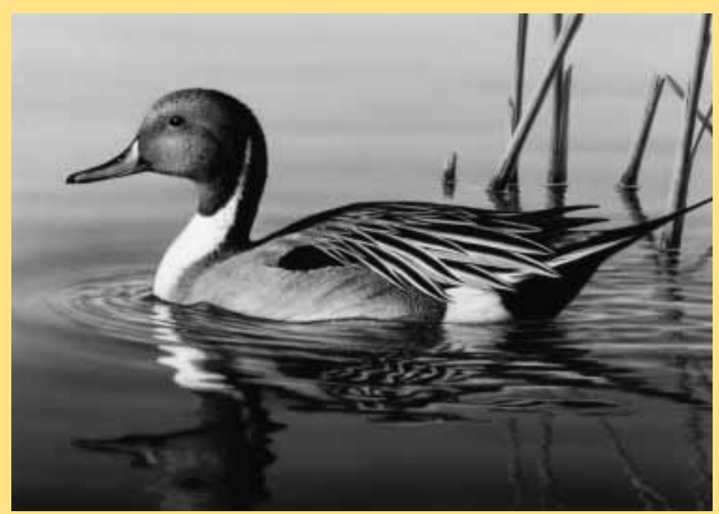
2000 Federal Duck Stamp Contest Winner Artist: Robert Hautman Species: Northern Pintail

Please look at bolded areas on page 2 for important messages.