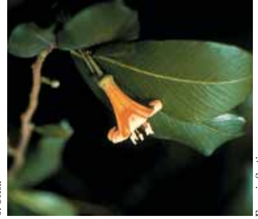
Goetzea elegans, typically found on mogotes.