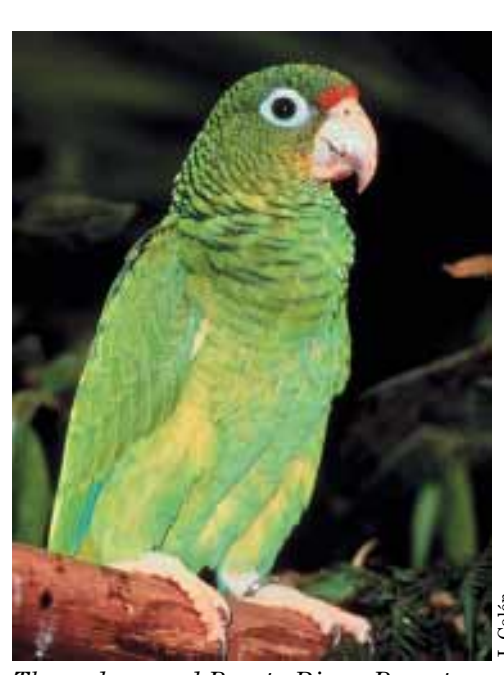
The endangered Puerto Rican Parrot (Amazona vittata).

The karst region harbors the richest biodiversity in Puerto Rico. More than 1,300 species of plants and animals are present in the karst. It is prime habitat for most of the native and endemic species of wildlife, including 30 federally listed threatened and endangered species. Many of these species are only known from karst ecosystems. More than 75 species of Neotropical migratory birds use the karst as wintering habitat.