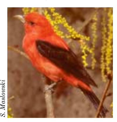
The scarlet tanager is just one example of the migratory birds on the Cherokee Reservation.