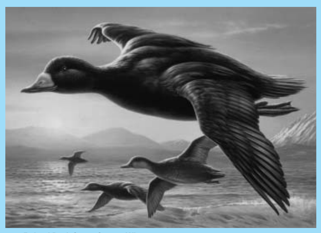
2001 Federal Duck Stamp Contest Winner

Please read all of the enclosed information very carefully and follow the instructions. If all instructions are not followed, your entry may be disqualified from the contest.