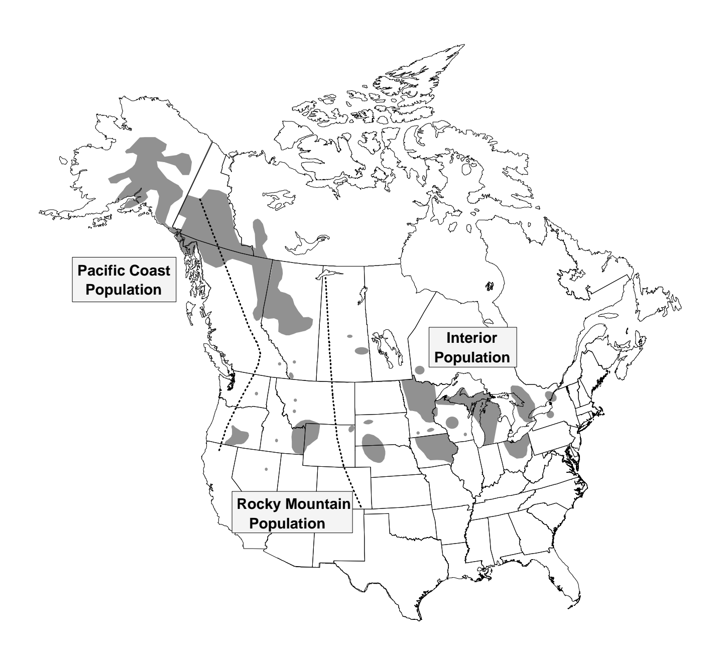
Fig. 1. Approximate ranges of Pacific Coast, Rocky Mountain, and Interior populations of trumpeter swans during late-summer of 2000.