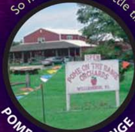
POME ON THE RANGE

Wineries are the perfect place for a leisurely stroll.