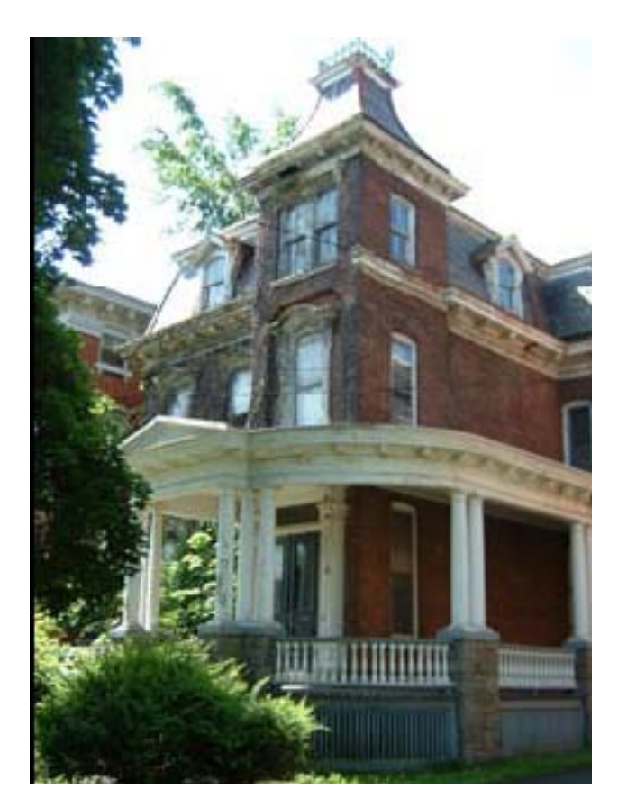
Figure 2. Tented House