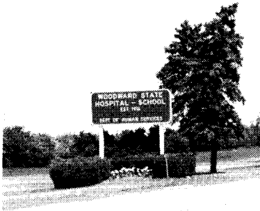
Woodward State Hospital and School gave up approximately 11 acres of high-quality farmground to plant the 2,900 tree windbreak which stretches 2 1/2 miles around the entire facility.

The hospital is located on 80 to 90 acres of ground and is the largest employer in the area. It contains local industry, classrooms, and living quarters for employees and patients. In cooperation with the Iowa Department of Natural Resources and the Center for Semiarid Agroforestry, the hospital has expanded a struggling two-row honeysuckle windbreak by adding two rows of