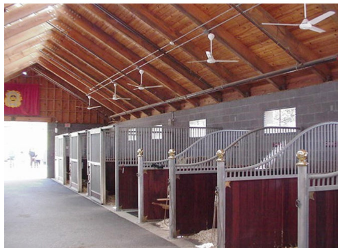
Ceiling fans can safely move air across animals.

commonly used at county fairs to move air, especially around large livestock. A growing trend at county fairs is to have all of the ventilation fans in a livestock building blowing air in the same direction or to blow air around the inside of a large building in a circular fashion similar to a racetrack. While not as effective as true tunnel ventilation used with many modern commercial livestock facilities, this method does tend to move air more effectively than having all the fans functioning independently. If possible, take advantage of prevailing winds.