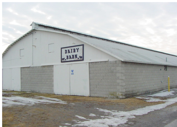
Building with solid walls built for an autumn fair.

1. Buildings originally were built for cool weather: Many fairgrounds have older buildings that were constructed when the county fair was held during cooler autumn weather. For whatever reason, the fair dates changed and the county fair is now held during much warmer weather. The older block and mortar buildings do not lend themselves to being remodeled or opened to allow summer breezes to blow through.