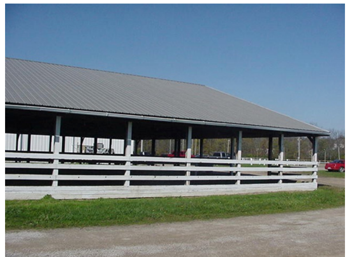
Open-sided fair building where tarps may be hung to provide shade for swine.

Properly sized ridge openings are sized for 2 inches of opening for each 10 feet of building width. Thus a 30-foot-wide building would need a 6-inch ridge opening. Ridge opening designs can incorporate continuous ridges or waterproof structures at proper intervals. As