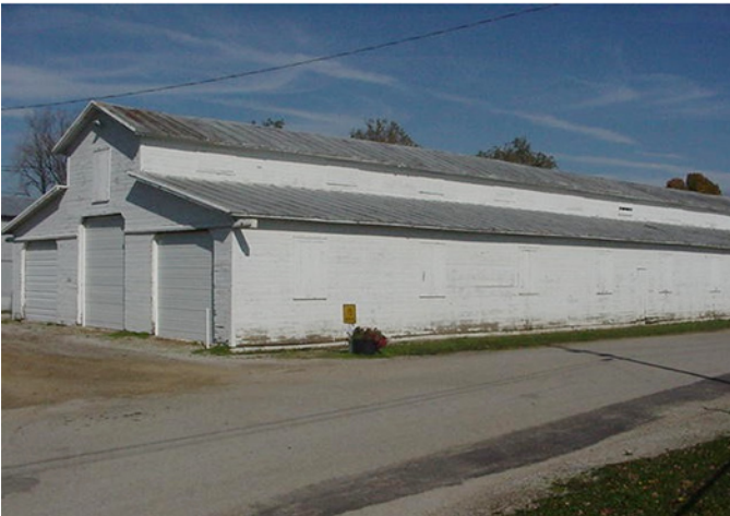
Older building with openings near the ridge to allow heat to exit the building.

2. Buildings primarily are used for storage: Many county fair buildings are used for storage during the non-fair season to generate income. A building that can be easily secured is more attractive for storage, so fair boards may not have an incentive to open buildings for the one week of the year during the fair when they house livestock.