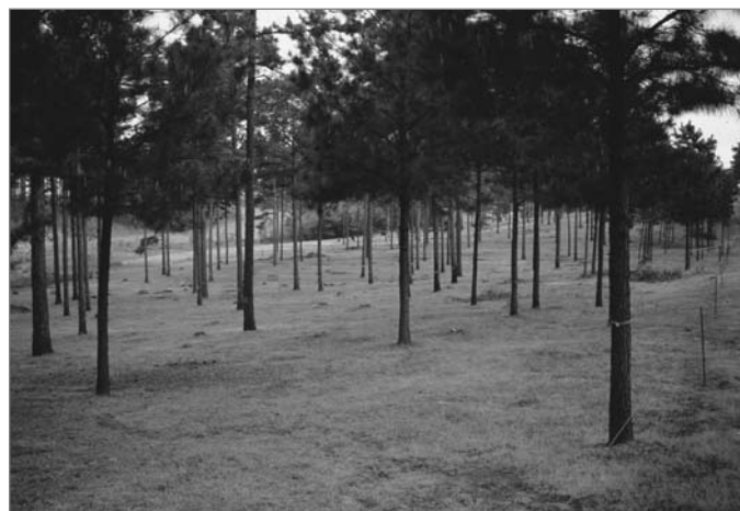
Young trees in this silvopasture have been pruned to improve future wood quality and to allow sun light to reach the ground for adequate forage production.

The relative portion of the tree height with branches, or live crown, affects the decision to prune in two ways. The first relates to the health and vigor of the tree and the second relates to the structural integrity of the tree and quality of its wood. Branches support the largest proportion of the energy-producing part of the tree, the needles or leaves. Removing too many branches removes leaves, weakening the tree, reducing growth, and making it more susceptible to insect and disease attack. During a single pruning operation, remove no more than one-third to one-half of the total crown. Branches on a tree trunk influence the form and development of the trunk. Trees with less than one-third live crown have poorer wood quality and develop weaker stems. Therefore, maintain a live crown of no less than one-third of the tree height.