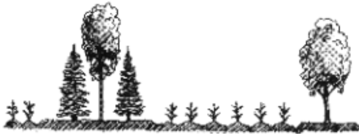
Alley cropping systems can be designed in various ways. Shown here is a three-row strip with training trees and a single-row of crop trees.

National Arbor Day Foundation Illustration