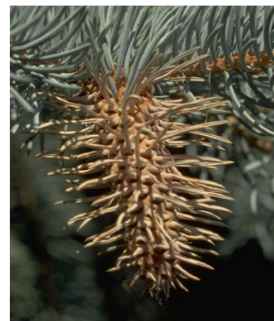
Figure 1: Gall on blue spruce.

On Douglas-fir, eggs are laid on the needles and several generations of woolly aphids are produced. Yellow spots and bent needles result from feeding damage. The trees appear speckled with tiny cotton-like forms of the insect. No galls are produced on Douglas-fir. Late in the summer, some of the woolly aphids develop wings and fly back to spruce to deposit eggs, which produce the overwintering population. Others are wingless and remain on Douglas-fir trees, where they produce other overwintering forms.