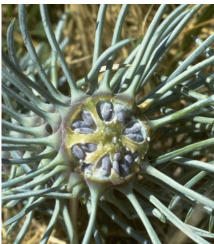
Figure 3: Gall cross-section showing developing insects.

1 Colorado State University Extension entomologist and professor, bioagricultural sciences and pest management.