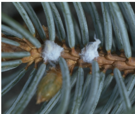
Figure 2: Overwintered females.

Always read and follow mixing and usage instructions on the label. Direct applications against the overwintering insect, preferably before egg production has begun. Treatments usually are best made during warm periods in fall (mid-October or November) or in late March through April.