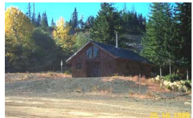
(Flattop shelter and parking lot)