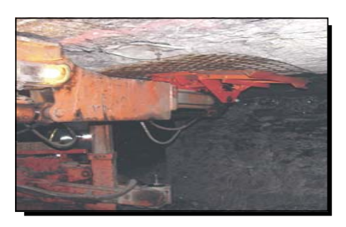
Continuous operator protection can be supplied by overlapping screens on cycle.

A PBS is a smaller sheet of wire screen (5x5 ft, with 4x4 inch openings, 8 gage wire) that weighs 11 lbs and can easily be handled by one person. It is easy to install with twinboom (non walk-thru) bolters in mid-lower height coal seams.