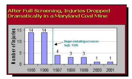
Screening can significantly reduce injury rates.