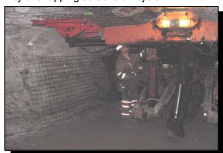
NIOSH trial installations indicate that the PBS can be installed much faster than a full screen, and it is easier to handle and store.

For more information contact: Chris Mark at: 412 386-6522