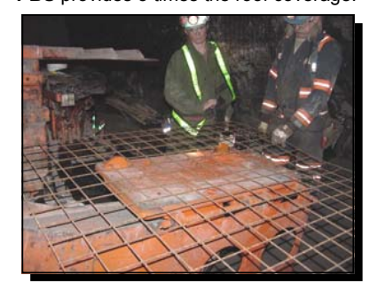
The PBS protects not just roof bolters but also continuous miner operators and others who will subsequently work or travel in the area.