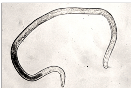
Figure 1. Adult root-knot nematode.

Nematodes are simple, multi-cellular animals—typically containing 1,000 cells or less. They are worm-like in appearance but are taxonomically distinct from earthworms, wireworms, or flatworms. They are bilaterally symmetrical, soft-bodied (no skeleton) non-segmented round worms. Most nematode species that attack plants are microscopic. The basic body plan of a nematode is a “tube within a tube.” Most nematodes are not pathogens but rather saprophytes. Some, however, are serious human, animal, and plant