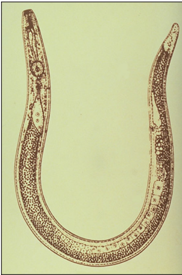
Figure 2. Adult lesion nematode.