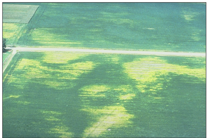
Figure 3. Aerial view of damage due to soybean cyst nematode.