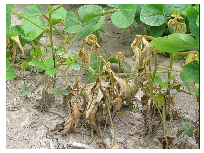
Figure 4. Phytophthora root and stem rot of soybean.

actively penetrate healthy plants is undoubtedly a contributing factor for their place collectively as the most important group of plant pathogens.