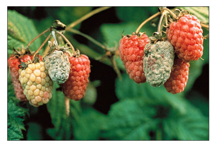
Figure 1. Botrytis on raspberries. Notice the dusting of gray spores.

Fungi and FLOs are eukaryotic organisms that lack chlorophyll and thus do not have the ability to photosynthesize their own food. They obtain nutrients by absorption through tiny thread-like filaments called hyphae that branch in all directions throughout a substrate. A collection of hyphae is referred to as mycelium (pl., mycelia). The hyphae are filled with protoplasm containing nuclei and other organelles. Mycelia are the key