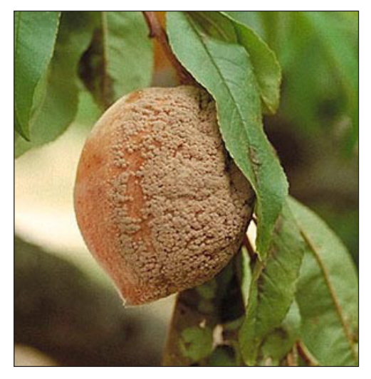
Figure 5. Brown rot of a peach fruit.

• Using genetically resistant species, cultivars, varieties, and hybrids. In many of the major crops, cultivars resistant to prevailing diseases are available, and more are continually being developed by plant breeders. As has been discussed with other types of diseases, the use of genetically resistant plants, if available, should be the first line of defense for diseases caused by fungi and FLOs. Several examples of cultivars genetically resistant to fungal and FLO disease are notable. Certain hybrid potato cultivars are resistant to late blight (Phytophthora infestans). Soybean cultivars resistant to downy mildew (Peronospora manshurica) have been developed. In the United States, apple cultivars are available from the Indiana and the New York agricultural experiment stations that show high resistance or immunity to apple scab (Venturia inaequalis), a devastating disease of apples grown in cool humid climates with summer rainfall. In the cereal crops (oats, wheat, rye, barley), powdery mildew (Erysiphe graminis) can be controlled only by the use of resistant cultivars developed by plant breeders. Tomatoes can be grown in Fusarium-infested soils only if