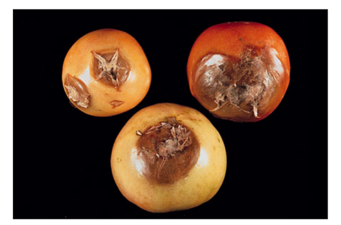
Figure 2. Fruit rot caused by the pathogen Rhizoctonia, which also can cause damping off, root rot, and stem cankers.

Fungi and FLOs can be beneficial as well as pathogenic. Beneficial fungi participate in biological cycles such as decaying dead animal and plant materials converting them into nutrients that are absorbed by living plants. Some beneficial fungi grow in a symbiotic relationship with the root cells of higher green plants; this life style is termed mycorrhizal . Roots of most