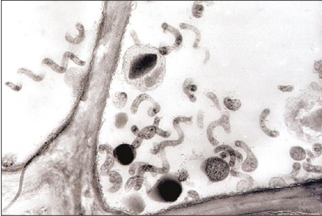
Figure 4. Spiroplasmas in the phloem of an infected corn plant.

they require a wound or natural opening, such as stomates, to get inside a plant host. Once inside they then kill host cells, by the means describe above, so that they can grow. Between hosts they may grow harmlessly on plant surfaces and then can overwinter or survive unfavorable environmental periods or the absence of a susceptible host by either going dormant in infected tissue, infested soil or water, or in an insect vector.