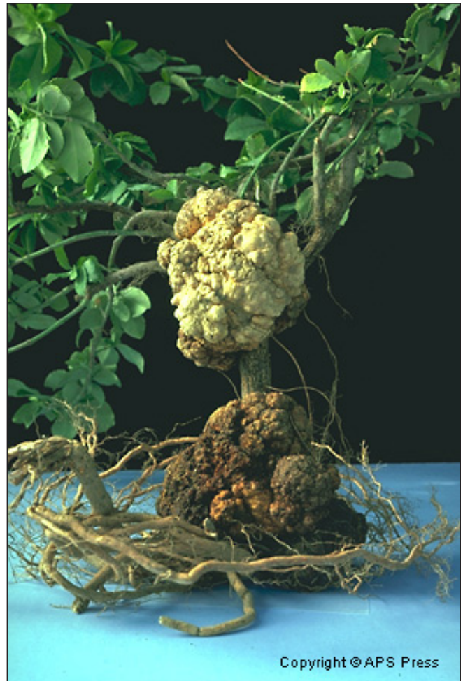
Figure 3. Crown gall, caused by Agrobacterium tumefaciens , on a burning bush.

layer that holds plant cells together. Still others colonize the water-conducting xylem vessels causing the plants to wilt and die. Agrobacterium species even have the ability to genetically modify or transform their hosts and bring about the formation of cancer-like overgrowths called crown gall.