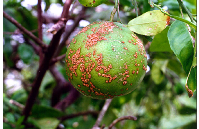
Figure 5. Citrus canker symptoms on fruit.