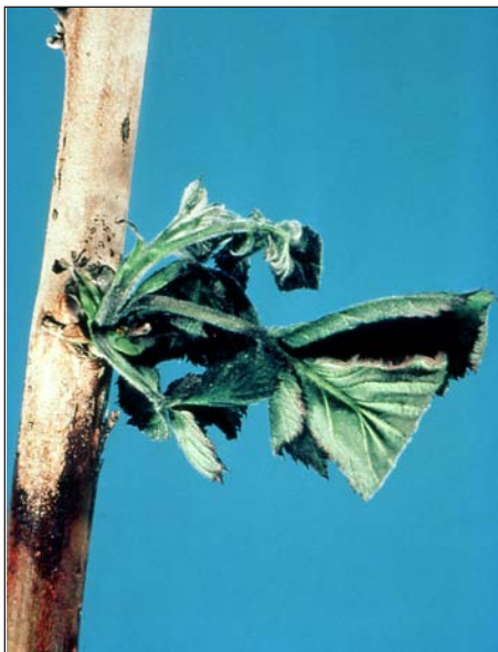
Figure 1. Cane blight lesion on thornless blackberry.

On first-year canes (primocanes) dark brown-to-purplish cankers form on new canes near the end of the season where pruning, insect, and other wounds are present. The cankers enlarge and extend down the cane or encircle it,