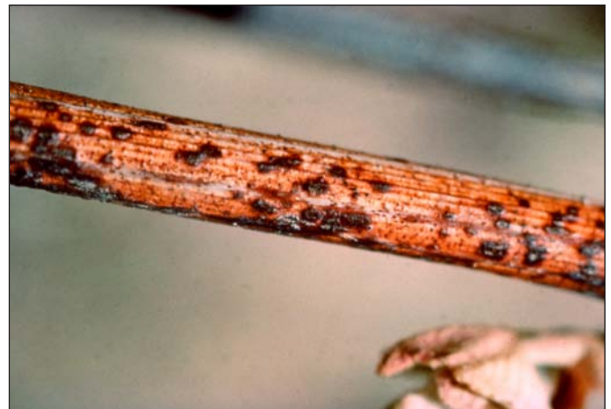
Figure 5. Phomopsis fruiting bodies (pycnidia) on a dormant cane.