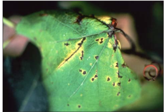
Figure 3. Symptoms on older leaves late in the season.

a shoot are affected. In time, the spots become larger, turn black, and have a yellow margin (Figure 3). Leaves become distorted and die if large numbers of lesions develop. Infections of leaf petioles may cause leaves to turn yellow and fall off.