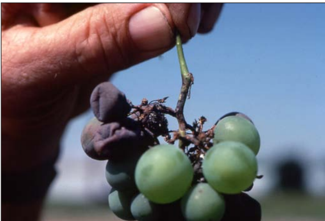
Figure 4. Symptoms of fruit infection.

Research has shown that berry infection can occur throughout the growing season; however, most fruit rot infections probably occur early in the season (pre-bloom to two to four weeks after bloom). Once inside green tissues of the berry, the fungus becomes inactive (latent), and the disease does not continue to develop. Infected berries remain without symptoms until late in the season when the fruit matures. Thus, fruit rot that develops at harvest may be due to infections that occurred during bloom.