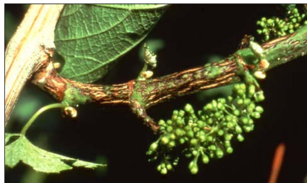
Figure 1. Spotting and cracking of grape cane caused by Phomopsis. These typical cane symptoms are usually present only on the first three to four internodes.

Leaf infections first appear as small, light-green spots with irregular, occasionally star-shaped, margins (Figure 2). Usually only the lower one to four leaves on