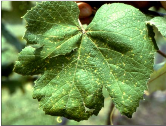
Figure 2. Symptoms on young leaves early in the season.