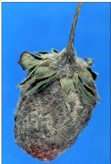
Figure 2. Later stages of gray mold fruit rot on strawberry. Note that the fruit is covered by a “gray” mass of fungus growth.