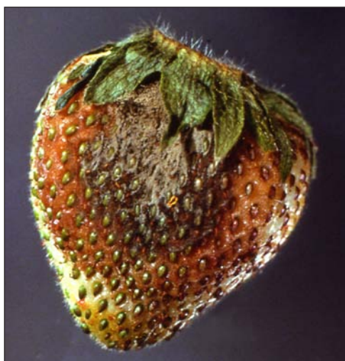
Figure 1. Early stages of gray mold fruit rot on strawberry.

Many fungi are capable of rotting mature or near-mature fruits of strawberry, raspberry, and blackberry. Under favorable environmental conditions for disease development, serious losses can occur. One of the most serious and common fruit rot diseases is gray mold. The gray mold fungus can affect petals, flower stalks (pedicels), fruit caps, and fruit. In wet, warm seasons, probably no other disease causes a greater loss of flowers and fruit. The disease is most severe during years with prolonged rainy and cloudy periods during bloom or during harvest.