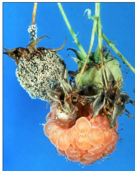
Figure 3. Gray mold fruit rot on raspberry.