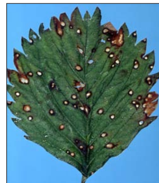
Figure 2. Strawberry leaf spot.

The fungus overwinters as spores in lesions on leaves. The fungus infects the plant and produces more spores in spots on the upper and lower leaf surface that spread the disease during early summer. These spores are spread by splashing rain. Middle-aged leaves are most susceptible. Lesions also develop on stems, petioles and runners.