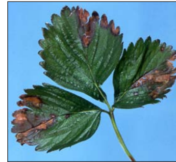
Figure 4. Strawberry leaf blight.

these spores can germinate and infect the plant within 24 hours. Older and middle-aged leaves are infected more easily than young ones.