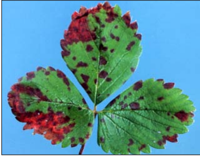
Figure 3. Strawberry leaf scorch.