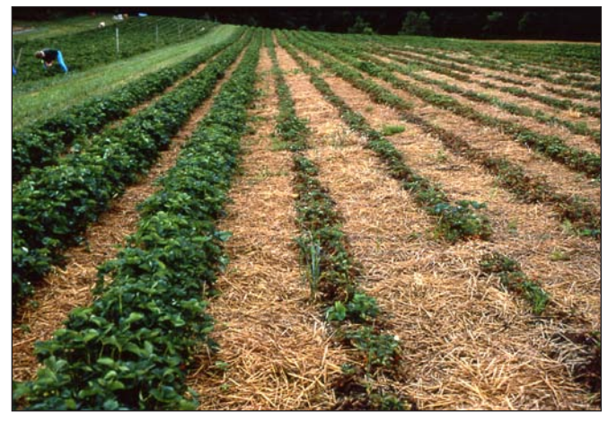
Figure 1. Strawberry field affected with red stele root rot. Susceptible variety on right, and resistant variety on left.

When plants start wilting and dying in the lower portions of the strawberry planting, the cause is very likely to be red stele (Figure 1). Infected plants are stunted, lose