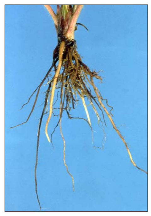
Figure 2. Strawberry root system affected by red stele.

The most reliable symptom of red stele is found within the roots and may be observed by gently digging up a few plants that are just beginning to wilt, taking care to preserve the root system. Plants with red stele usually have few fine