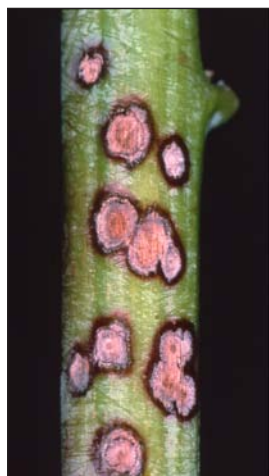
Figure 1. Anthracnose symptoms on black raspberry.

Anthracnose first appears in the spring on the young shoots as small, purplish, slightly raised or sunken spots. Later, they enlarge and become ash gray in the center with