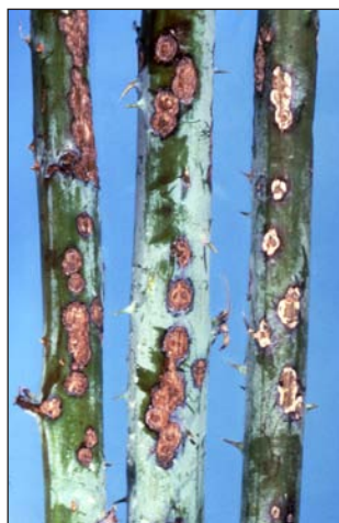
Figure 2. Anthracnose symptoms on thornless blackberry cane.

slightly raised purple margins. The spots are often so close together on black and purple raspberries that they form large irregular areas (cankers). The cankers may encircle the cane, sometimes causing the death of the cane beyond the canker. The bark in badly cankered areas often splits. Late season infections result in superficial gray, oval spots. The spots have definite margins, but are not sunken. They may become so numerous that the spots blend together, covering large portions of the cane. This is the characteristic “gray bark” symptom which is common on red raspberry. Dark colored specks (fungal fruiting bodies) develop in circles on the gray bark. Anthracnose sometimes attacks the leaves and can cause some leaf drop. Small spots, about 1/16 inch in diameter, with light gray centers and purple margins appear on the leaves. Lesion centers later fall out, leaving a shot hole effect.