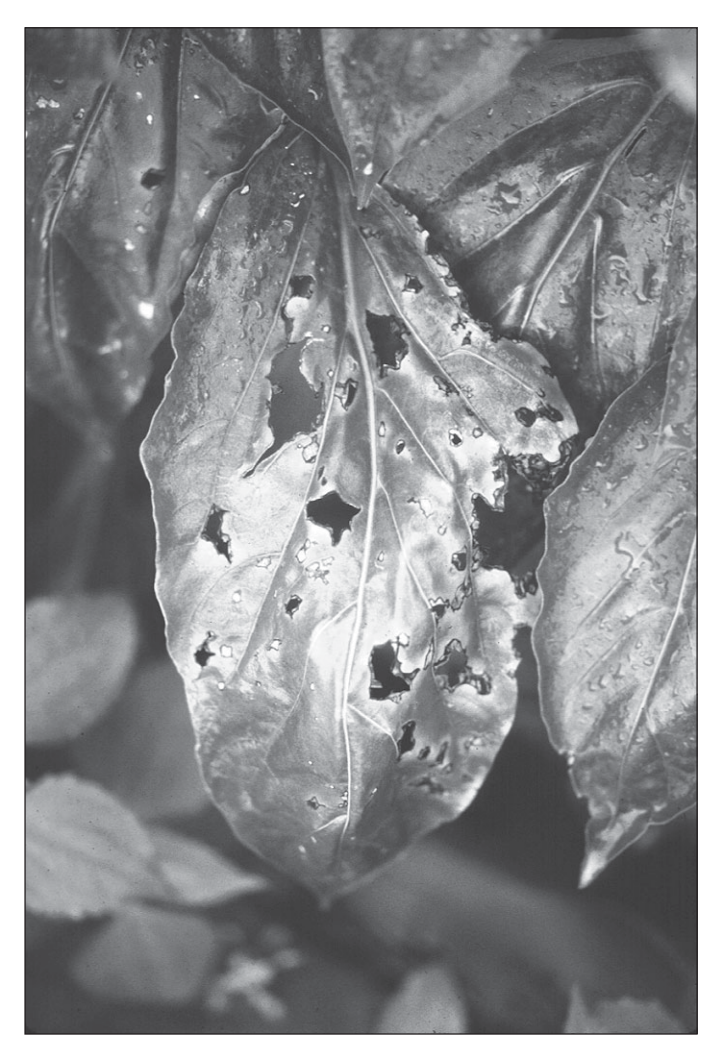
Figure 1. Bacterial spot symptoms on pepper leaves.

survive on dried seeds for up to 10 years. It is not able to survive free in soil for a long time, but can survive up to 6 months in infected crop debris in soil. The bacterium penetrates leaves through stomata and/or wounds, and fruits through wounds created by wind-driven sand, insect punctures, or mechanical injury. Dissemination of the bacterium occurs between and