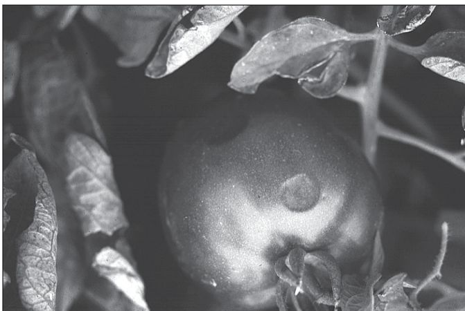
Figure 1. Early symptoms of Anthracnose on a tomato fruit. Lesions are sunken, circular, and watersoaked.

Commercial growers of tomatoes may wish to consider use of a forecasting system such as TOMCAST to time fungicide application. (See OSU Extension Bulletin 672 for current fungicide recommendations and a description of the TOMCAST program.)