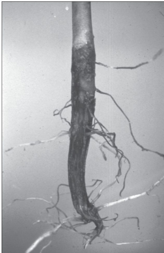
Figure 2. Fusarium root rot of bean with characteristic reddish-brown lesions on both tap and side roots.

Visit Ohio State University Extension's web site "Ohioline" at: ohioline.osu.edu