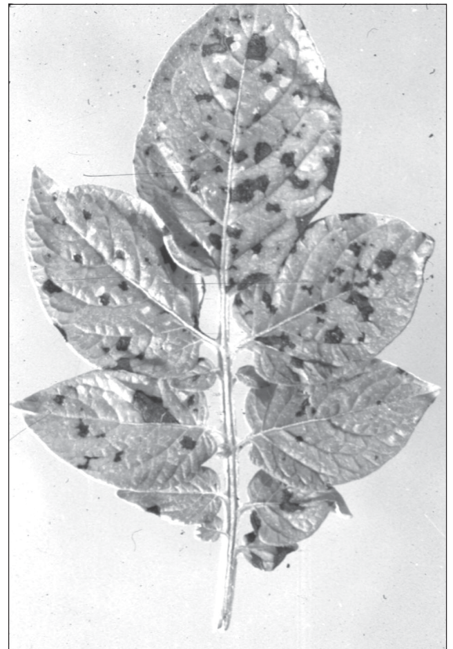
Figure 1. Dark brown, angular early blight lesions on a potato leaf.

flowering stage. On older fruits, early blight causes dark, leathery sunken spots, usually at the point of stem attachment. These spots may enlarge to involve the entire upper portion of the fruit, often showing concentric markings like those on leaves. Affected areas may be covered with velvety black masses of spores. Fruits can also be infected in the green or ripe stage through growth cracks