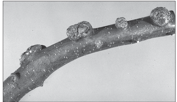
Figure 2. Crown gall on plum branch.

to produce healthy leaves and blossoms. This disease may have little noticeable effect on older plants.