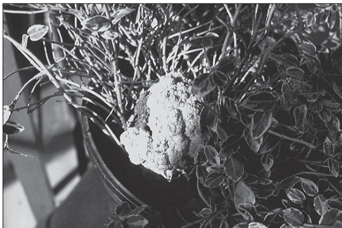
Figure 3. Crown gall on euonymus bush.

for two or more years even in the absence of susceptible plants. Sometimes the bacteria are carried on seeds. Fresh wounds in stems or roots are essential for the bacteria to invade host tissues. These wounds commonly occur during planting, cultivation and pruning, and during propagation when grafting and taking cuttings. Soil insects and nematodes can also cause root wounds providing entry sites.