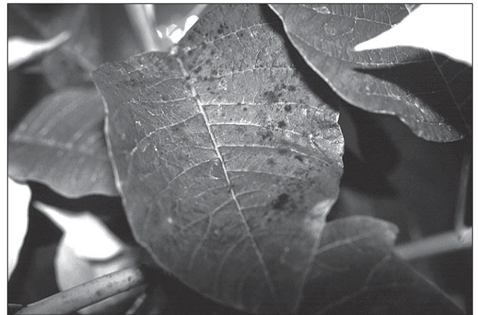
Figure 2. Sooty mold on the surface of a poinsettia leaf.