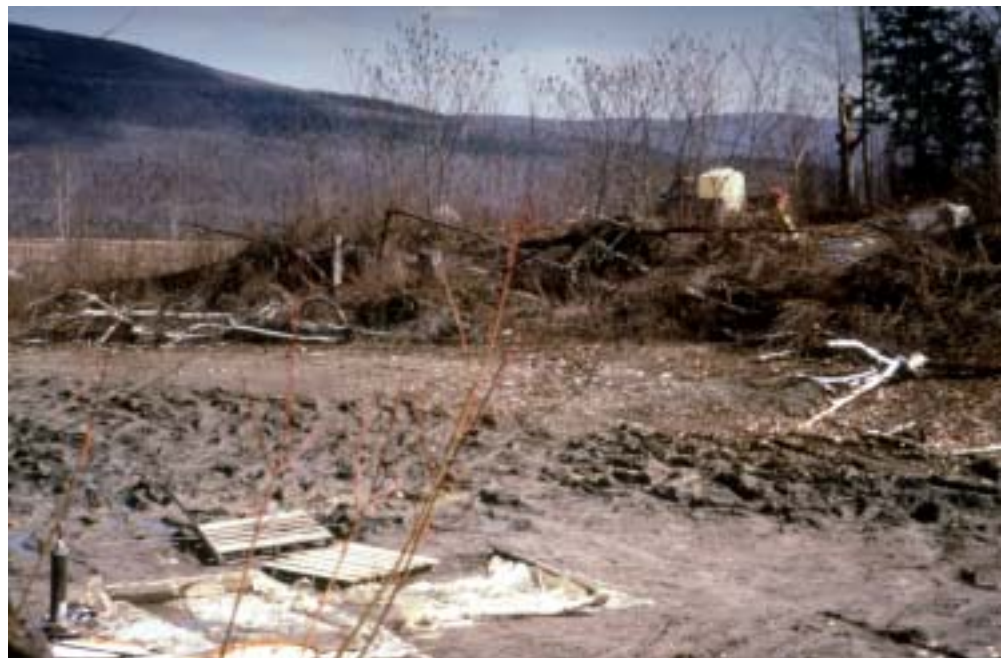
Debris and chemical wastes contaminated wetlands adjacent to the Bennington Landfill.

Located in rural southwestern Vermont, the Bennington Landfill was initially a site for sand and gravel excavation. In June 1969, the landfill began receiving residential, commercial, and industrial wastes. These wastes included highly toxic substances, such as paint thinner, inks, glues, solvents, and scrapped capacitors containing polychlorinated