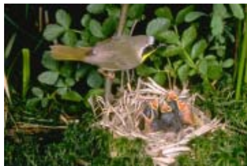
Habitat for common yellowthroats (above), and other migratory birds, including thrushes, wrens, sparrows, warblers, and herons, was degraded by contaminants from the Bennington Landfill.

After determining that the landfill had contaminated surrounding wetlands used by migratory birds, the U.S. Fish and Wildlife Service and the State of Vermont worked together to negotiate a natural resource damage settlement with the