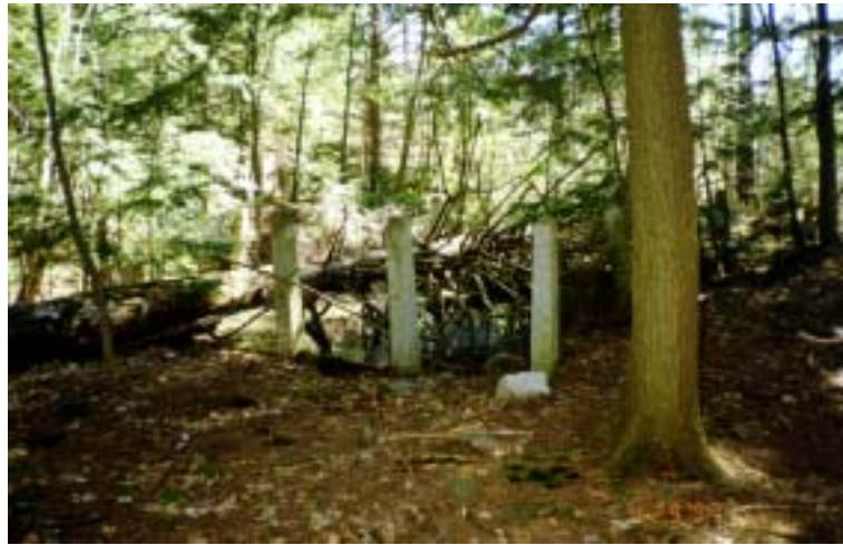
An antiquated cistern alters hydrologic conditions and provides limited access to wildlife prior to restoration.