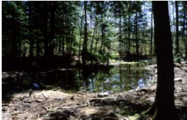
After the cistern's removal, the natural hydrology of this woodland pool is restored and access to wildlife is improved.

responsible party, the Town of Bennington. As part of the settlement, the town agreed to protect and restore wildlife habitat. Bennington obtained a conservation easement to permanently protect 14 acres of uncontaminated forested wetland habitat, including numerous woodland pools. Natural hydrologic conditions on the property were restored by removing an antiquated water collection system consisting of concrete cisterns and underground pipes. A citizen committee oversaw the restoration work, created trails and interpretive signs, and helped local schools integrate the restoration activities into their biological and social science curriculums. As a result of these efforts, high quality wetland wildlife habitat has been created and recreational and educational opportunities have improved.