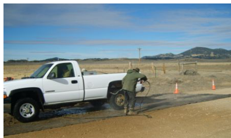
Volunteers help to remove invasive plant seeds from a truck in Montana.

The Charles M. Russell National Wildlife Refuge, in partnership the South Phillips County Ranchers Stewardship Alliance, used funding provided through a volunteers and invasives grant to wash vehicles during the 2007 hunting season. A portable wash system was rented and then manned by volunteers to wash vehicles of hunters entering and leaving the refuge. Over 40 vehicles were washed in two days by volunteers who contributed more than 100 hours of their time. In addition, 100 free car wash certificates were given away to hunters in the nearby town of Malta. Recreational vehicles can be one of the most significant vectors for spreading invasive plants on public lands. This project deserves special recognition because it emphasizes prevention; stopping the problem before it starts. Contact: Lindy Garner (406) 727- 7400 ext. 213.